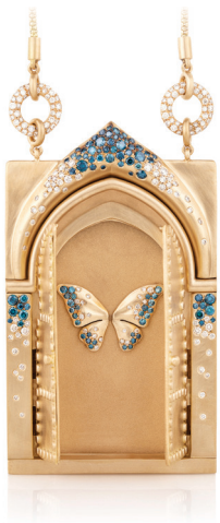
Nada Ghazal 18K gold necklace, champagne diamonds, and blue diamonds MSRP $36,550 nadaghazal.com +961 1 255804