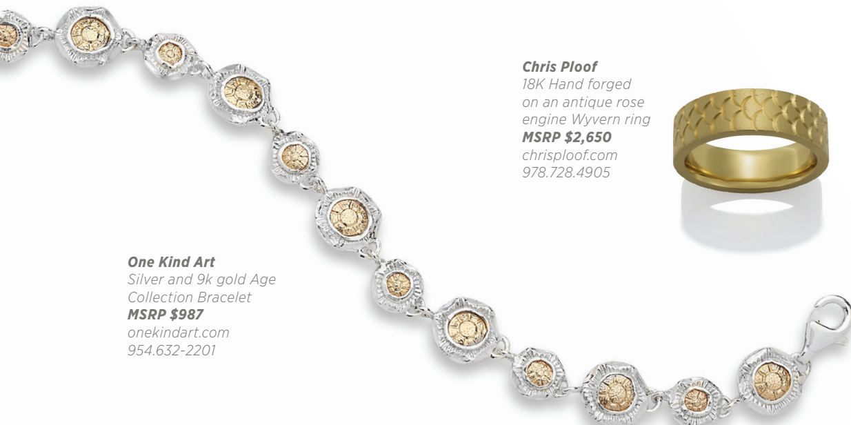
One Kind Art Silver and 9k gold Age Collection Bracelet MSRP $987 onekindart.com 954.632-2201

Wear jewels with sea-spiration all day, or revel in those Disney princess storylines