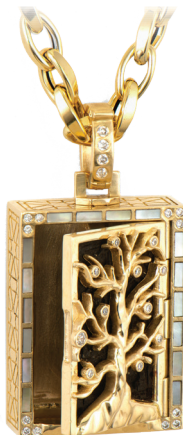
Three Stories Jewelry 14k yellow gold, diamonds, and MOP, ebony, lapis & more. MSRP $23,000 threestoriesjewelry.com 310.291.3837

As a locket and pendant, the doors reflecting this trend often function, opening and closing to reveal a hidden treasure inside. Symbolic of the public shift back into routines and going out, door jewelry is a talisman for freedom.