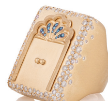
Nada Ghazal 18K gold ring, champagne diamonds and blue diamonds MSRP $8,115 nadaghazal.com +961 1 255804