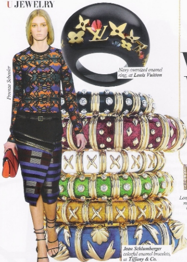
Navy oversized enamel ring, at Louis Vuitton