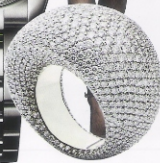
18K white gold Pinouette ring paved with white brilliant diamonds, by Vhernier, at Sylvie Saliba