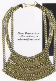
Fiona Paxton chain collar necklace, at urbanoutfitters.com

Ethnic embellishments add stylish character and a fresh spin on everyday dressing. Stack on vivid bangles, boast an oversized enamel ring, or fall for extra long pendants made to wow.