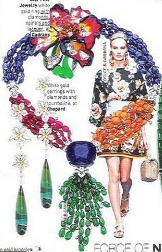
White gold earrings with diamonds and tourmaline, at Chopard