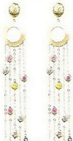
EDITOR'S PICK Yellow gold earrings with precious stones, at Madao.com

Cara Delevingne is in a diamond set by Chopard and a Burberry gown.