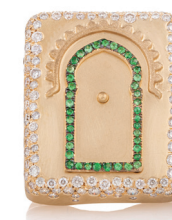
Nada Ghazal 18K gold ring, champagne diamonds and tsavorites MSRP $8,820 nadaghazal.com +961 1 255804