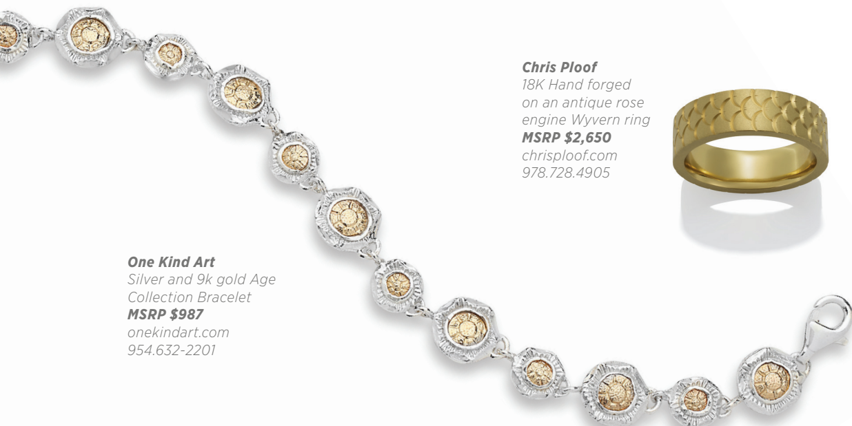
One Kind Art Silver and 9k gold Age Collection Bracelet MSRP $987 onekindart.com 954.632-2201

Wear jewels with sea-spiration all day, or revel in those Disney princess storylines