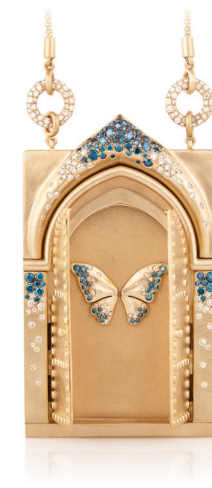
Nada Ghazal 18K gold necklace, champagne diamonds, and blue diamonds MSRP $36,550 nadaghazal.com +961 1 255804

As a locket and pendant, the doors reflecting this trend often function, opening and closing to reveal a hidden treasure inside. Symbolic of the public shift back into routines and going out, door jewelry is a talisman for freedom.