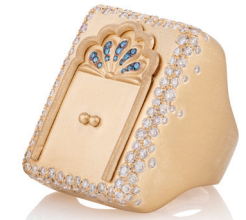
Nada Ghazal 18K gold ring, champagne diamonds and blue diamonds MSRP $8,115 nadaghazal.com +961 1 255804