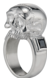
KIL N.Y.C. Sterling silver and black onyx cranium ring MSRP $250 kil-nyc.com 646.824.1502