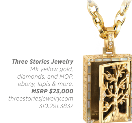
Three Stories Jewelry 14k yellow gold, diamonds, and MOP, ebony, lapis & more. MSRP $23,000 threestoriesjewelry.com 310.291.3837