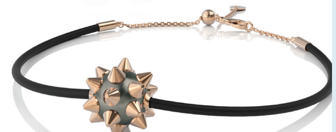
Xander Jane 15mm black South Sea pearl choker studded with 18k rose gold spikes MSRP $9,000 xanderjane.com 604.722.5355