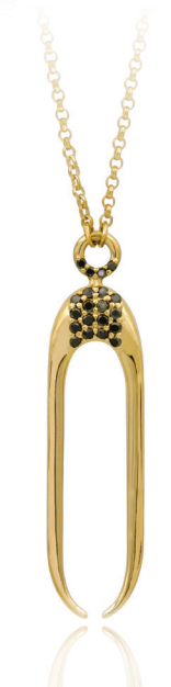
Rachel Weld Horned pendant 18K yellow gold with black MSRP $3,674 rachelweld.com